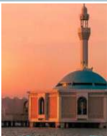
THE FLOATING MOSQUE

This traditional market feels like a real-life treasure hunt. Look for colorful scarves, shiny jewelry, yummy snacks, and handmade gifts. Don't forget to try Saudi qahwa (coffee) and dates with friends!