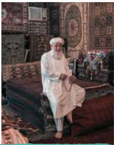
SOUQ AL ALAWI